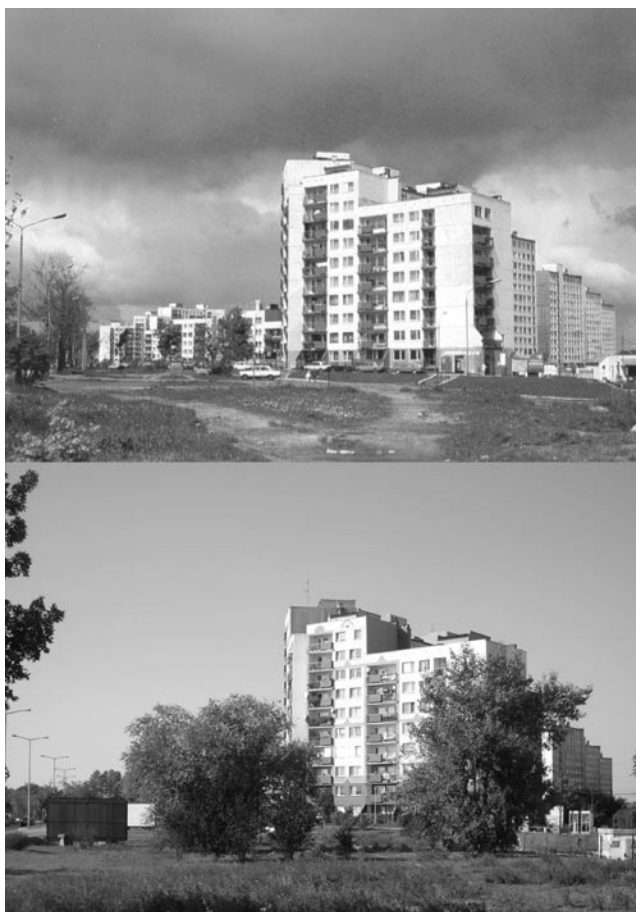
Fig. 6. Kozanów housing estate in 1997 and 2007. The image of blocks of flats in Wrocław worsened during the last decade

areas of the city has relatively worsened, pushing the blocks of flats up in the hierarchy of disliked places. This negative image does not reflect the factual changes in the landscape though: in Kozanów most of the blocks have been renovated or redecorated in the last decade and many new, well managed public green areas have been established.