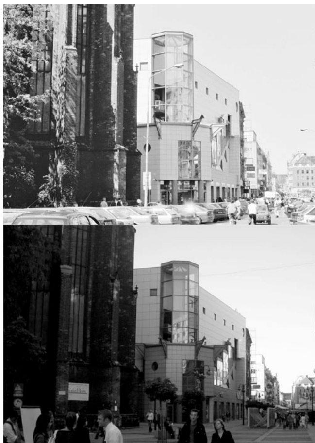
Fig. 2. Ulica Świdnicka (Świdnicka Street) in Wrocław in 1997 and 2007. A part of Stare Miasto (Old Town) that significantly improved its image during the last decade

that in 1997 most people saw the two places as a whole and according to this general approach Ogród Japoński was not distinguished in the results of the survey. Conversely, in 2007 Ogród Japoński was perceived as a distinct entity and 10.19% of respondents indicated it as one of their favourite places. Moreover, if we total the scores of Ogród Japoński and Park Szczytnicki in 2007 (which gives 26.86%) we will discover that the ranking order of the first five most liked areas did not change in the last decade!