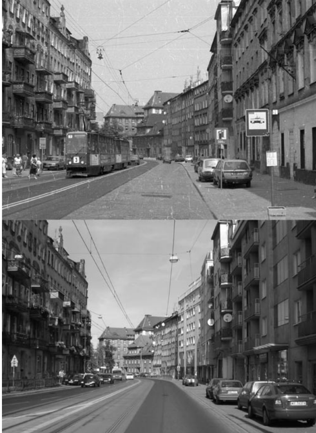
Fig. 5. Ulica Traugutta in 1997 and 2007. The opinion of this 19th century urban area is persistently negative, despite the visible improvement in the landscape

Apparently those two localities did not change significantly during the last decade. However, a closer analysis indicates that both of them are steadily improving. The surface of Ulica Traugutta was renewed, some run-down buildings were replaced by new investments, offering a higher standard of living. It seems that this development is reflected by the opinion among the inhabitants: the percentage of people disliking this area has decreased from 35.40% in 1997 to 19.45% in 2007.