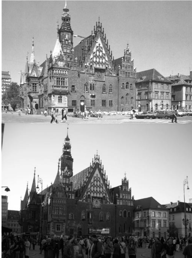
Fig. 3. Rynek (Market Square) in Wrocław in 1997 and 2007. The most characteristic, high-quality public space in the city

While understanding the complex perception of Park Szczytnicki we may easily interpret the change in the level of approval of Rynek and Ratusz. This area, like Ulica Świdnicka described above, has been completely renovated (Fig. 3). Not only has the surface been replaced but also old, historical buildings have been restored. This overall improvement of the landscape is probably the reason for the success of this area in the opinion polls in 2007.