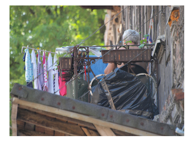
Fig 2. The old residents' familiar world

The new residents , though in general referred to as gentrifiers, are a diversified group in terms of basic demographic and socio-economic indicators, as well with respect to local integration patterns. New residents develop bridging social networks in terms of age, family status, profession or nationality, but usually maintain contacts with people of similar educational and socio-economic status. According to the way they function within their neighbourhood, four general subgroups can be distinguished. Analogous subgroups and roles have been identified by other authors: the engaged, the alienated (or lonely, isolated, see: Middleton et al., 2005), students